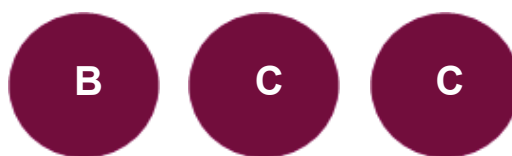
Financial services North America Global Average